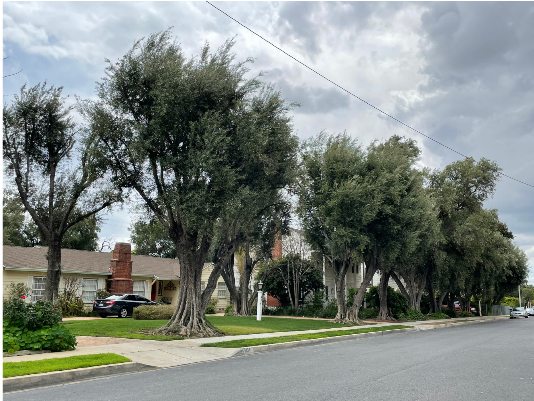
Olive trees 416-422-428-434 Newton Street