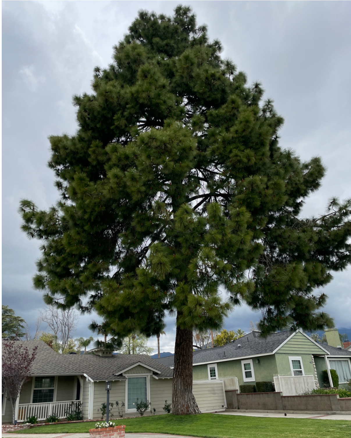
Pine tree 615 N Huntington Street