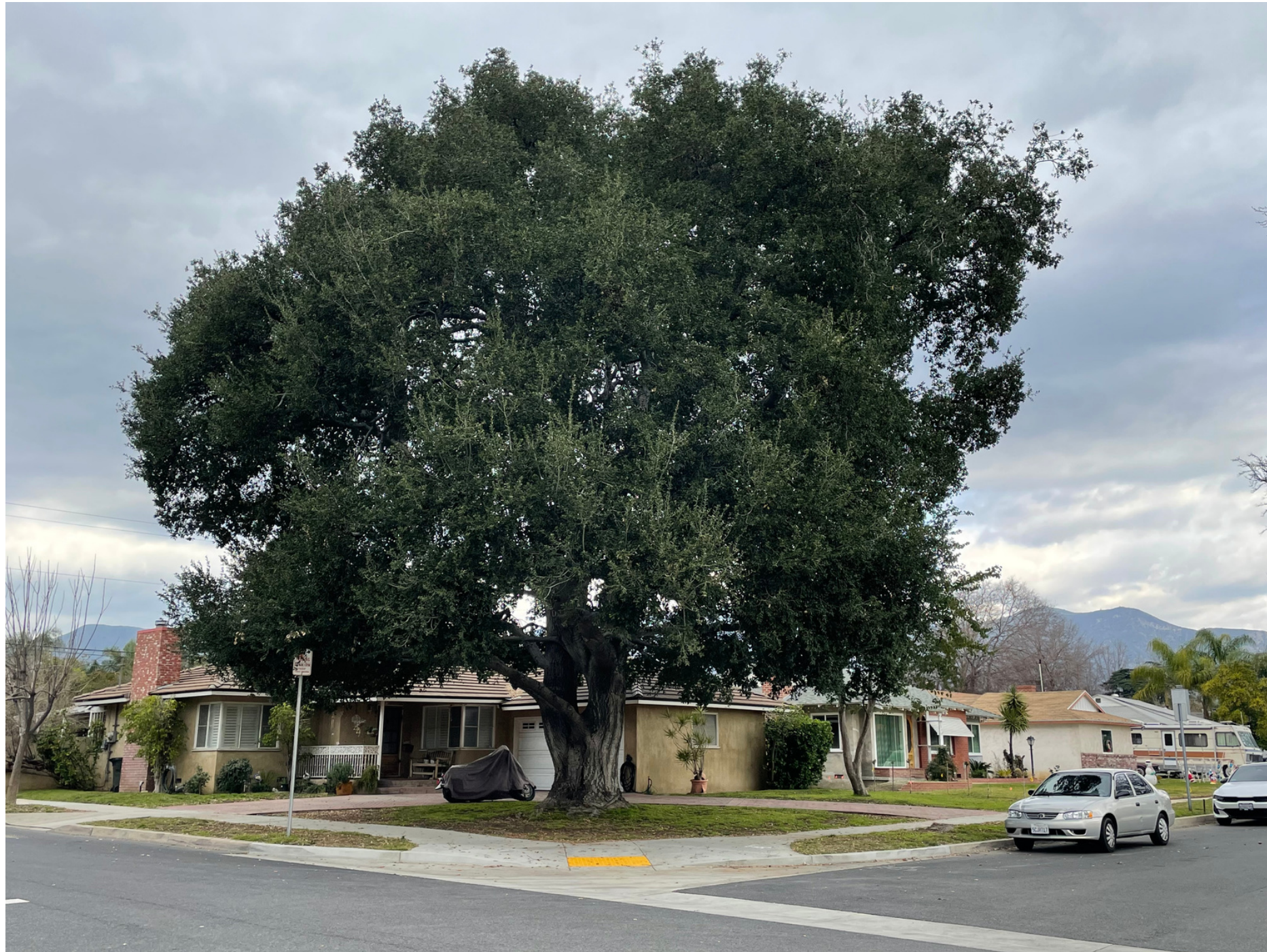
Oak tree 503 North Huntington Street, at the corner of Library Street