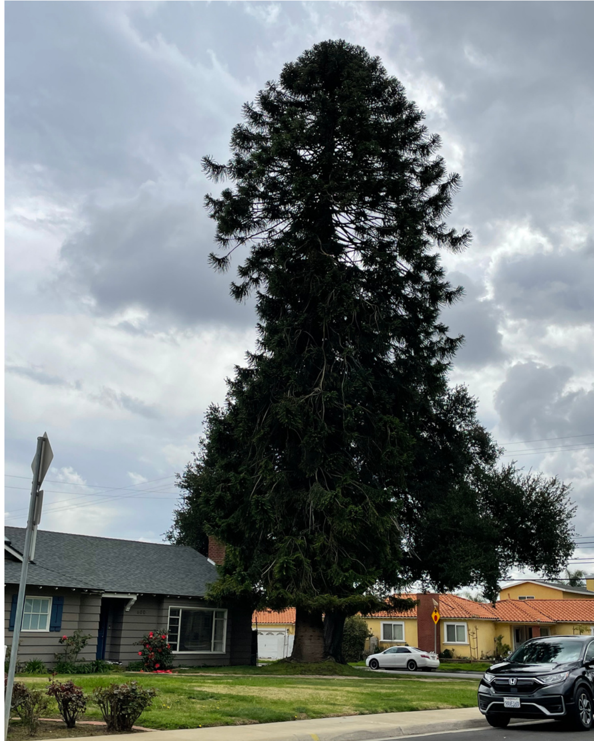
Araucaria tree 600 N Huntington St, at the corner of Fifth Street